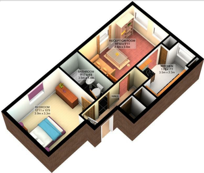
ATLAS HOUSE TOTAL APPROX. FLOOR AREA 489 SQ.FT. (45.4 SQ.M.)

For illustrative purposes only. Decorative finishes, fixtures, fittings and furnishings do not represent the current state of the property. Measurements are approximate. Not to scale Made with Metropix ©2019